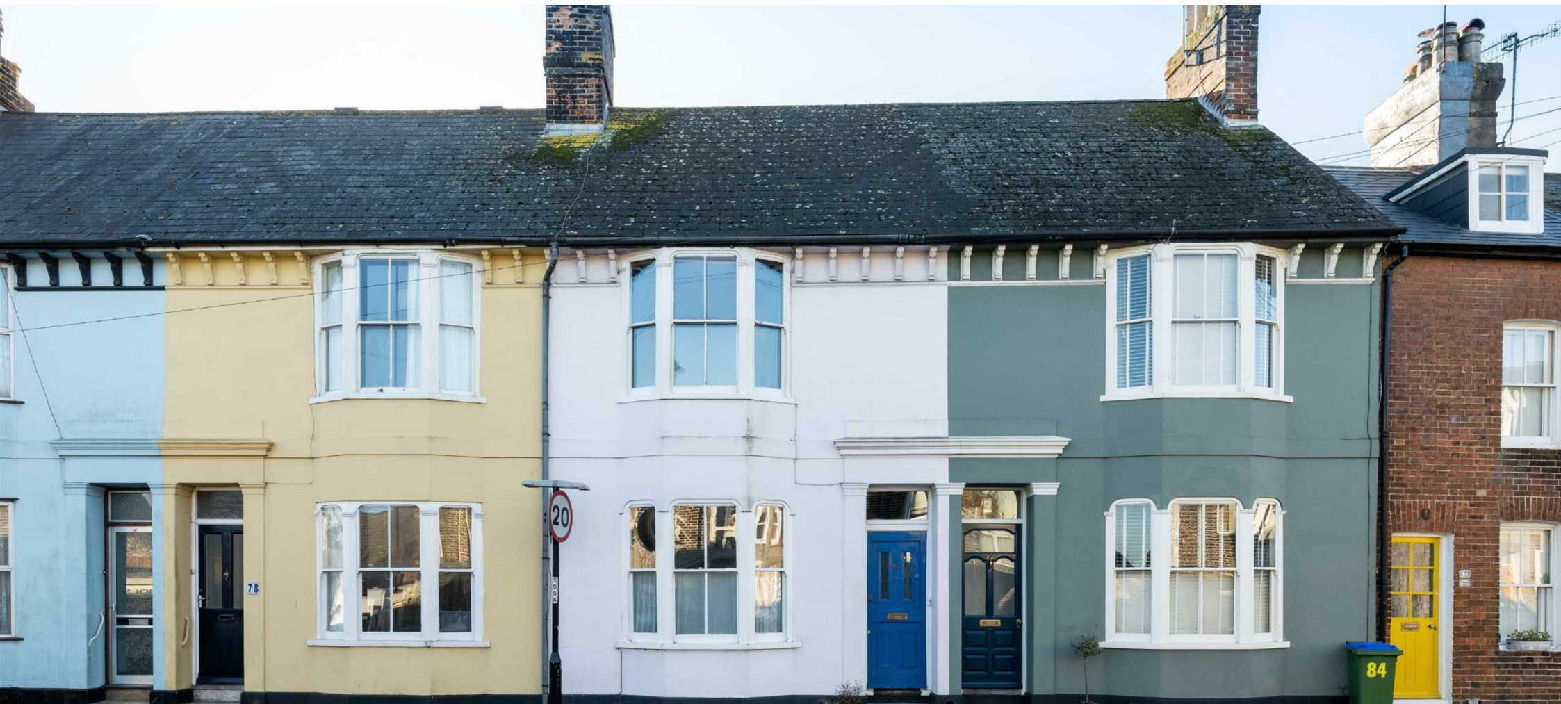
Western Road, Lewes